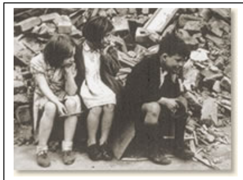
British children sitting amidst the bombing rubble.