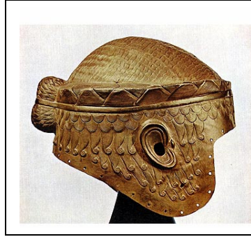
← Helmets made of bronze!

Infusing English skills in Social Studies: A synonym for stolen is _____.