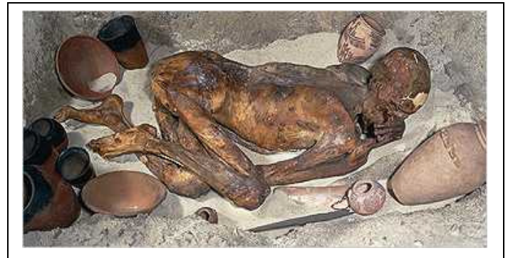
Sumerian burial with possessions for the afterlife ↑

BONUS: Copper ore & tin, when heated at high temperatures & melted together, form _____! (clue: ..as in the ___ Age!)