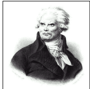
↑ Georges Danton

What made Danton so popular with his people?