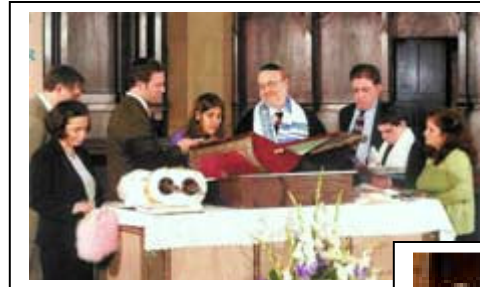
Girls & boys at their respective Bat & Bar Mitzvahs . ↑ → ↓