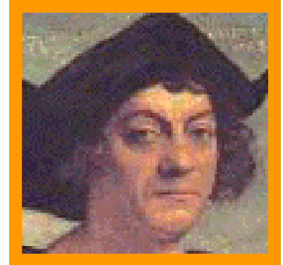
Christopher Columbus ↑

Columbus argued that East Asia would be (longer than / shorter than / the same as (circle 1 ↑) the trip around Africa's southern coast.